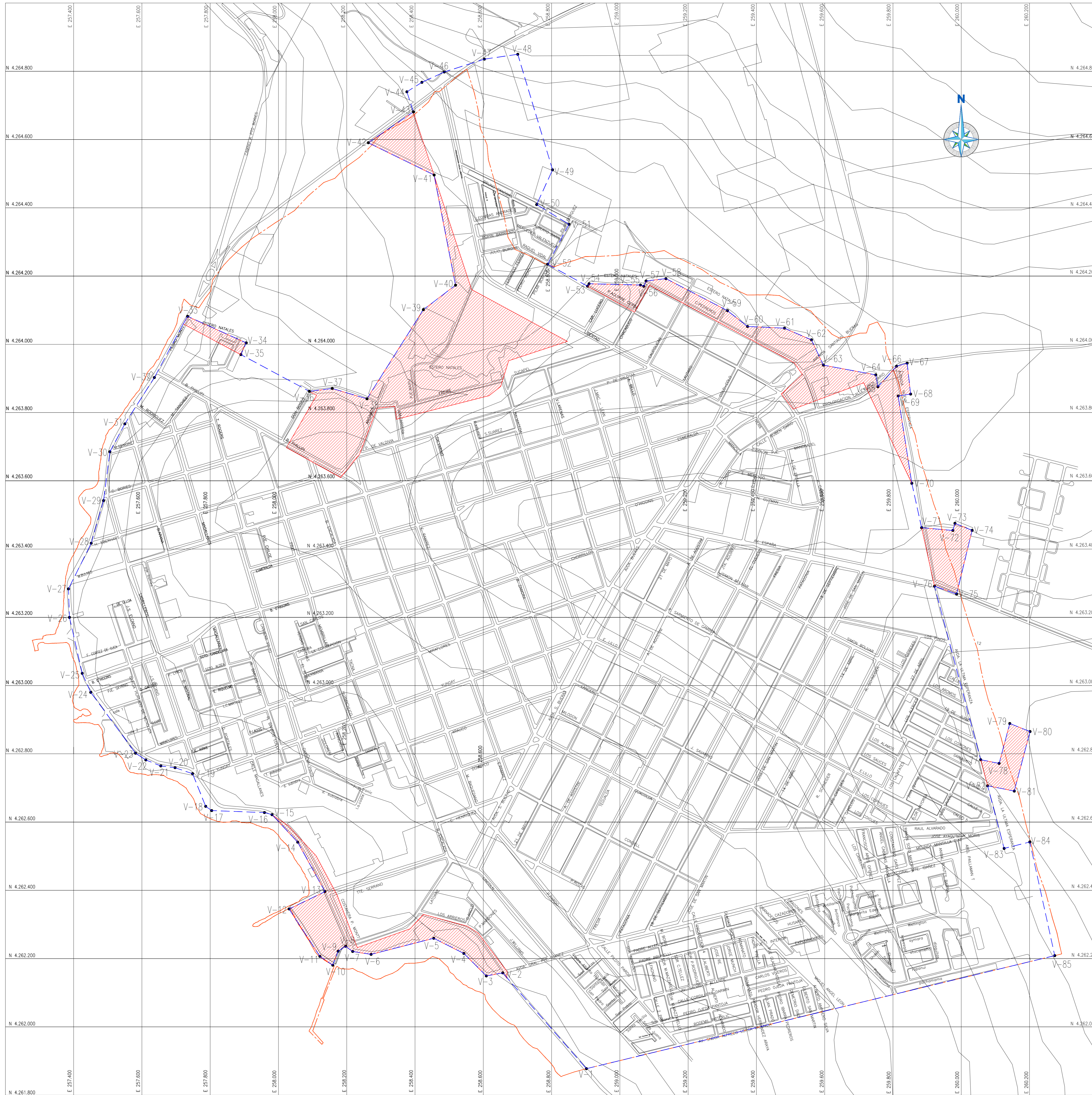
CUADRO DE COORDENADAS DATUM WGS 84 - HUSO 19